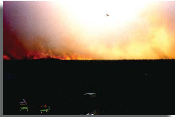
Miller Reach Big Lake Fire